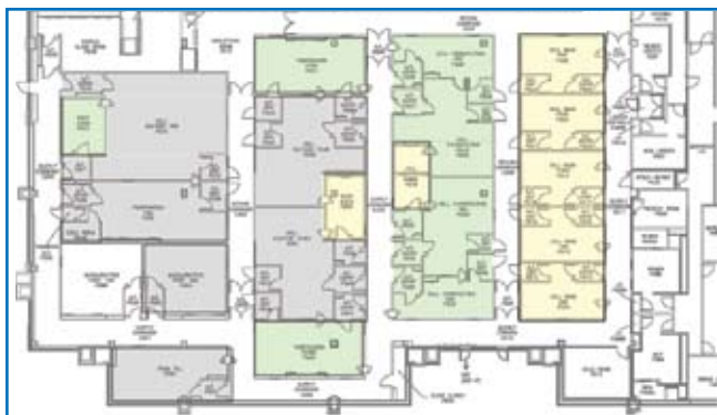
GMP MANUFACTURING SPACE

WuXi AppTec's 75,000-square-foot site in Philadelphia consists of GMP cell banking and GMP/GTP cellular therapeutics manufacturing facilities along with testing laboratories. Our GMP and GTP manufacturing is conducted in individually equipped, positive-pressure suites with Class 5 laminar flow hoods. All suites are HEPA filtered and the rooms and equipment are continuously monitored and alarmed. Validated systems and procedures, as well as routine environmental monitoring, ensure the highest quality in aseptic processing.