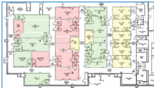
GMP MANUFACTURING SPACE

WuXi AppTec's 75,000-square-foot site in Philadelphia consists of GMP cell banking and GMP/GTP cellular therapeutics manufacturing facilities along with testing laboratories. Our GMP and GTP manufacturing is conducted in individually equipped, positive-pressure suites with Class 5 laminar flow hoods. All suites are HEPA filtered and the rooms and equipment are continuously monitored and alarmed. Validated systems and procedures, as well as routine environmental monitoring, ensure the highest quality in aseptic processing.