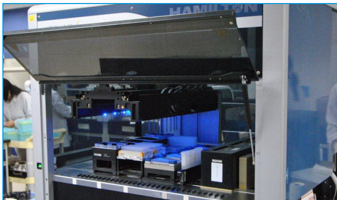
Liquid handler, 8 channels, Hamilton Star

For more information on WuXi AppTec's services please contact: